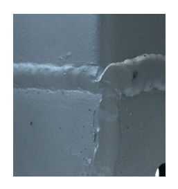
Galvanized Level 5