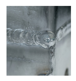
SST Level 3