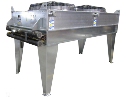
Air Cooled Condensers

CE(PED) Certification, ASME Sec. VIII, Canadian Registration Number, UL508, Canadian Standards Association