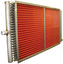
Heating and Cooling Coils