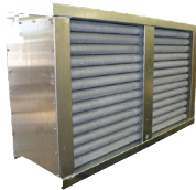
Heat Pipes for Heat Recovery