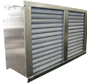
Heat Pipes for Heat Recovery