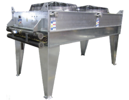
Air Cooled Condensers

CE(PED) Certification, ASME Sec. VIII, Canadian Registration Number, UL508, Canadian Standards Association