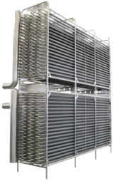
Heating and Cooling Coils