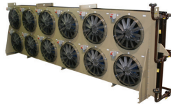
Dry Coolers for Glycol or Gas Cooling