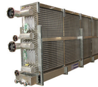
Custom Evaporators & Baudelot Coolers