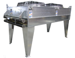
Air Cooled Condensers

CE(PED) Certification, ASME Sec. VIII, Canadian Registration Number, UL508, Canadian Standards Association