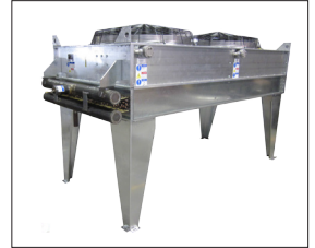
Air Cooled Condensers

CE(PED) Certification, ASME Sec. VIII, Canadian Registration Number, UL508, Canadian Standards Association