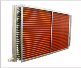
Heating and Cooling Coils