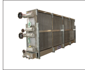
Custom Evaporators & Baudelot Coolers