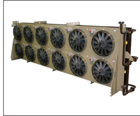
Dry Coolers for Glycol or Gas Cooling