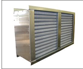
Heat Pipes for Heat Recovery